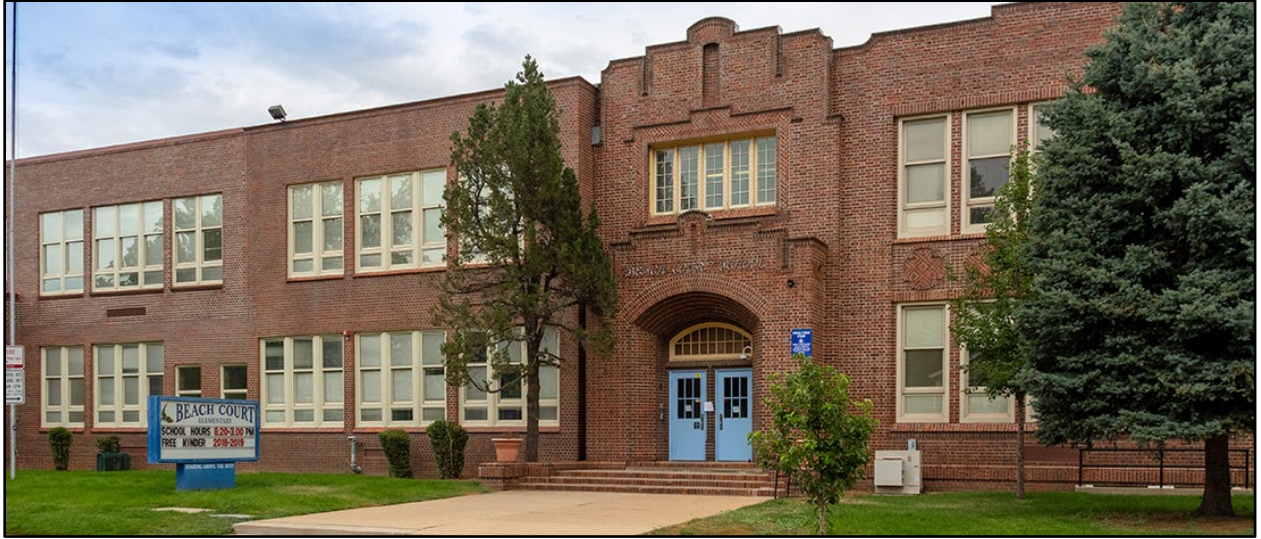
Beach Court Boys & Girls Club at Beach Court Elementary