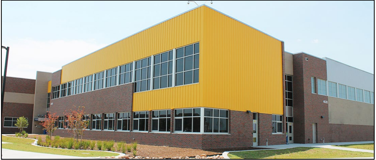
Green Valley Ranch Boys & Girls Club at KIPP Northeast