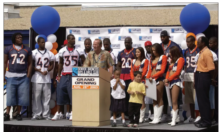
Denver Broncos owner Pat Bowlen addresses the crowd at the opening of the Denver Broncos Boys & Girls Club in 2003.