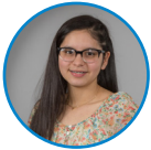
Club Member Spotlight